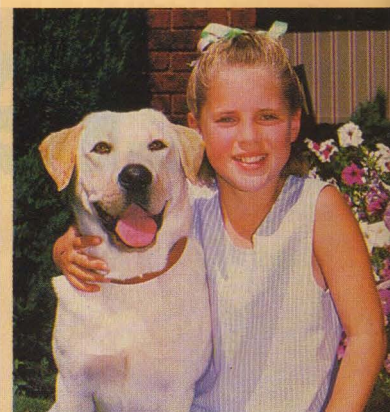
▲ Brave Bouncer from Neighbours : a canine shoulder to cry on

You can give a dog a bad name, but don't give it a bad home. RT