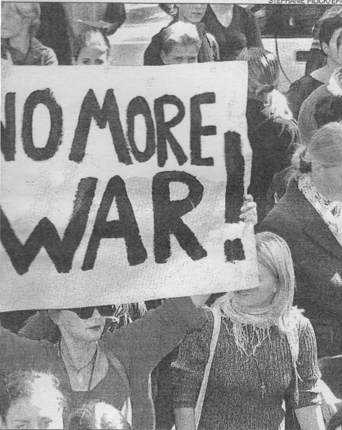
old as religion; pacifists believe that refusing to fight can defeat evil

gious belief. Benjamin Britten and Michael Tippett, for instance, were both resolute objectors to the "just war" of 1939-45. Both cited their connection with the PPU in presenting their cases.