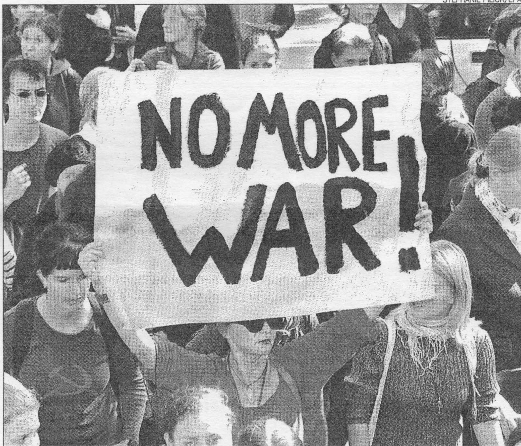
Conscientious objection is as old as religion; pacifists believe that refusing to fight can defeat evil

Modern conscientious objection emerged in response to the horrors of the First World War. In the 1930s, as the threat of another war began to grow, there were those who looked for alternatives to slugging it out. Vulnerable to charges of cowardice and lack of patriotism, the opposition to war took a big step forward when, on October 16, 1934, a letter appeared in the Manchester Guardian calling on people to write a postcard stating that they would "renounce war and never