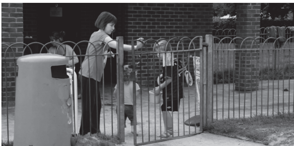
Justine opening a gate: A still from the film, Justine

When storytelling, it's important to ask: how do the subjects of these stories benefit from their involvement and who else benefits? Despite Justine's micro-budget, interest in the film on the educational and film festival screenings